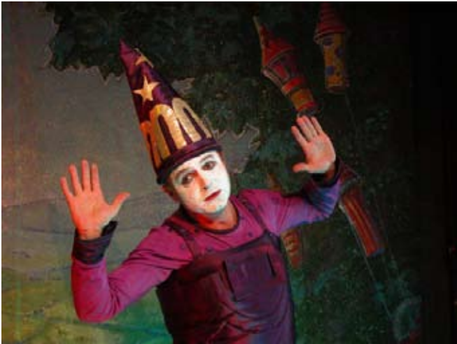
Above: The Remarkable Rocket by Oscar Wilde coming to Draíocht, February 2009.