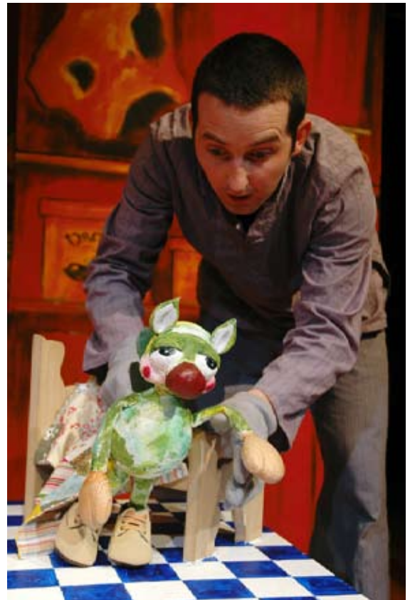
Above: Branar's Na Síoga agus An Gréasaí .

Below: Christmas Greetings from everyone at Baboró!