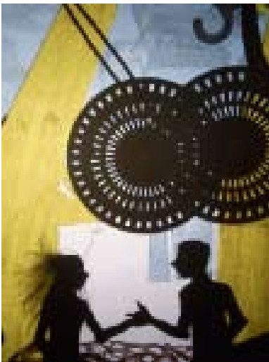
Left: Púca Puppet's Róisín agus an Rón .

See Púca's page under production companies at www.irishtheatre-online.com or contact: pucapuppets@eircom.net