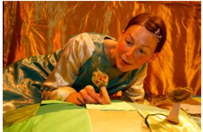
Above: Monkeyshine Theatre presents The Bedmaker , May 2009.

For information and contact details, see www.theatrepapilio.com