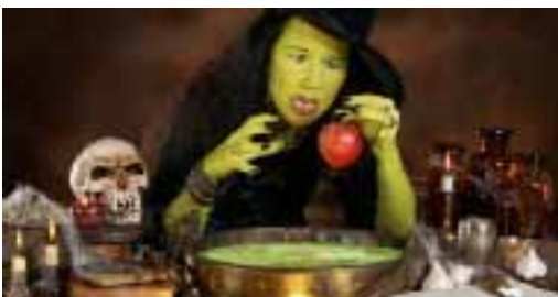
A Scare at Halloween by Red Thread Theatre Company