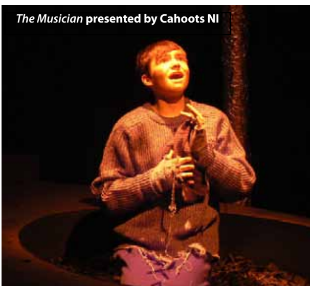
The Musician presented by Cahoots NI