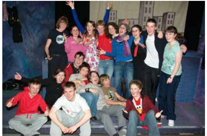
Above: Kilkenny Youth Theatre; Below: Junior KYT.

There continues to be a huge demand from young people to be involved with our youth theatre groups. Although we cannot increase the number of groups, Barnstorm will explore ways of serving this demand with short and/or once-off modules.