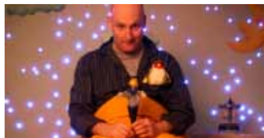
Ahhh! by Pignut Productions

For full details, visit www.draiocht.ie/whatson/education.htm